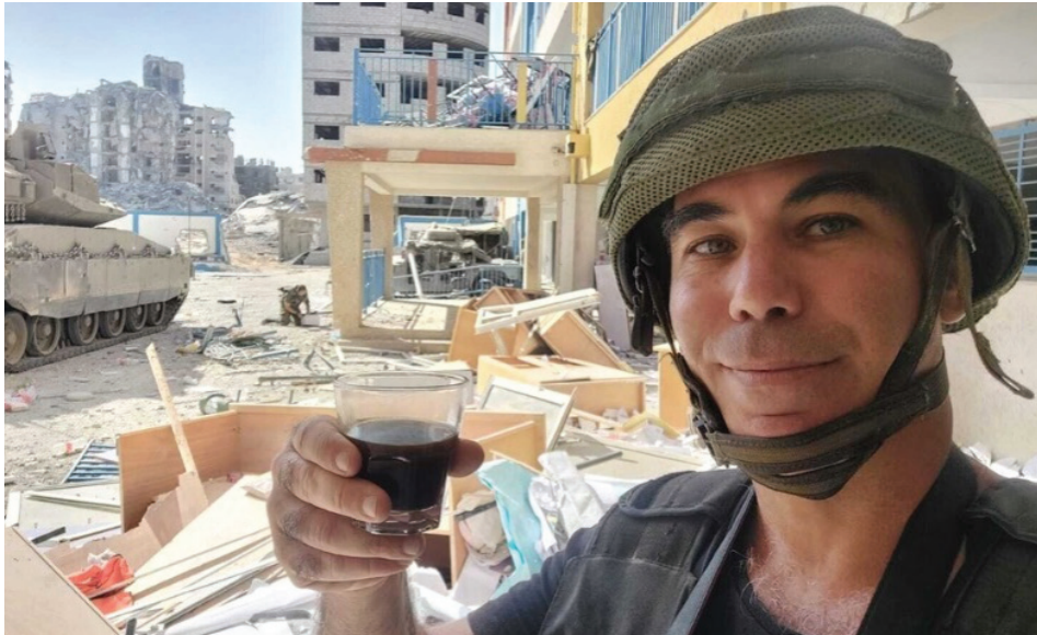
An Israeli journalist drinking coffee amid the ruins of Gaza City