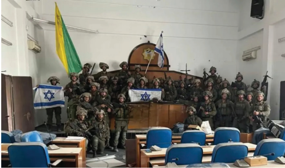
Soldiers from the Golani Brigade, after taking control of the Hamas parliament building in Gaza