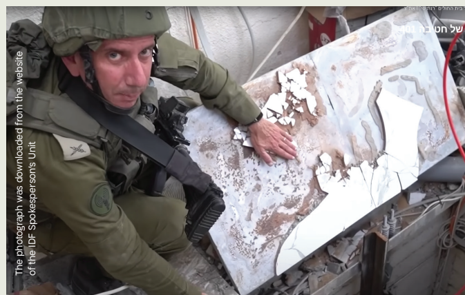
In the photograph: Rear Admiral Daniel Hagari, the IDF Spokesperson, displaying a Hamas command center found beneath Shifa Hospital

(Arabic, with Hebrew subtitles. 9.5 minutes). Source: YouTube